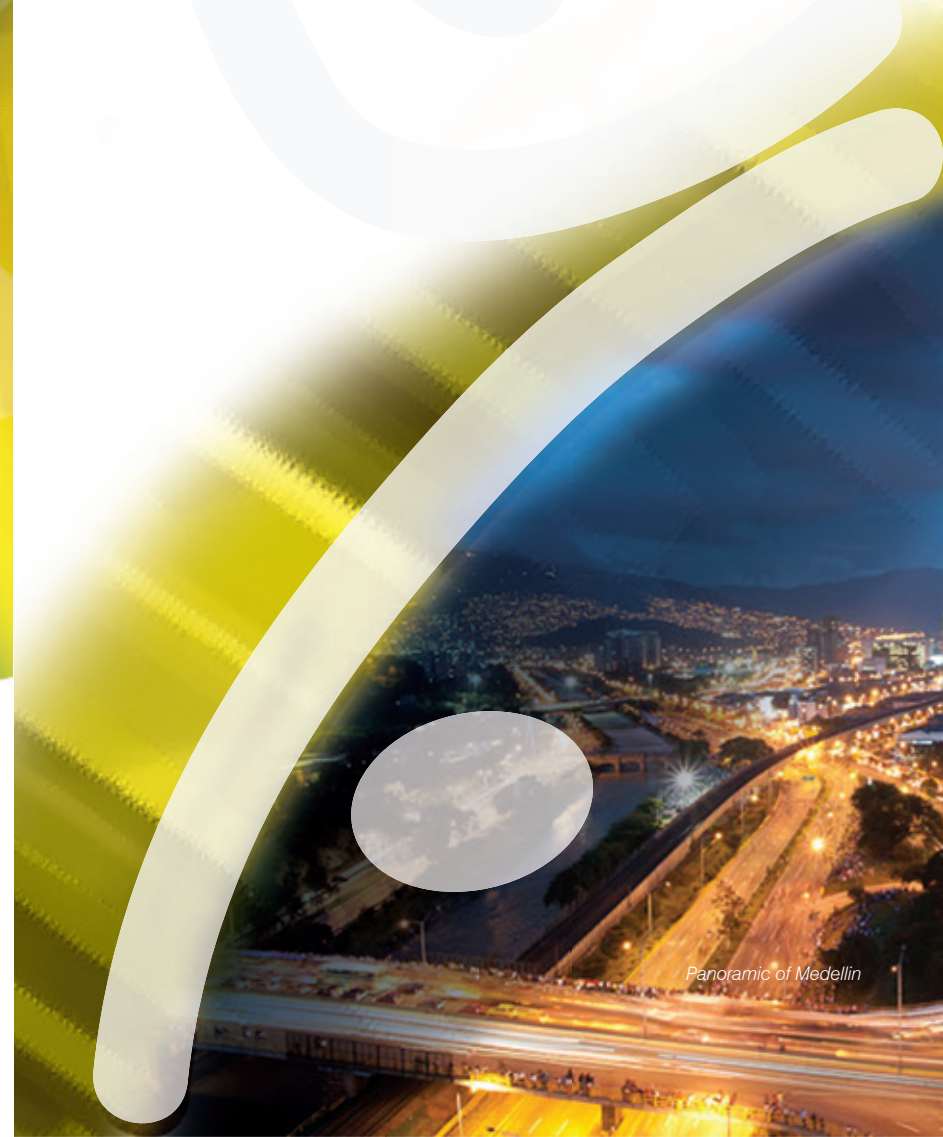
Panoramic of Medellín

According to the statutes of the World Union, the World Congresses must be rotated to be held in the different continents. The 8th Congress was designated to be hosted in Latin America. In a meeting of the Confederation of ASIA Latin America held in Mexico in November 2008 it was decided that the 8th World Congress would be organized by the Colombian Federation at the city of Medellín. In 2013. This will be the first time that such an event is hosted in our continent. This decision was presented and approved by WUJA at the 7th Congress held in Bujumbura, Burundi in 2009. The 9th WUJA Congress will have The United States as its host.